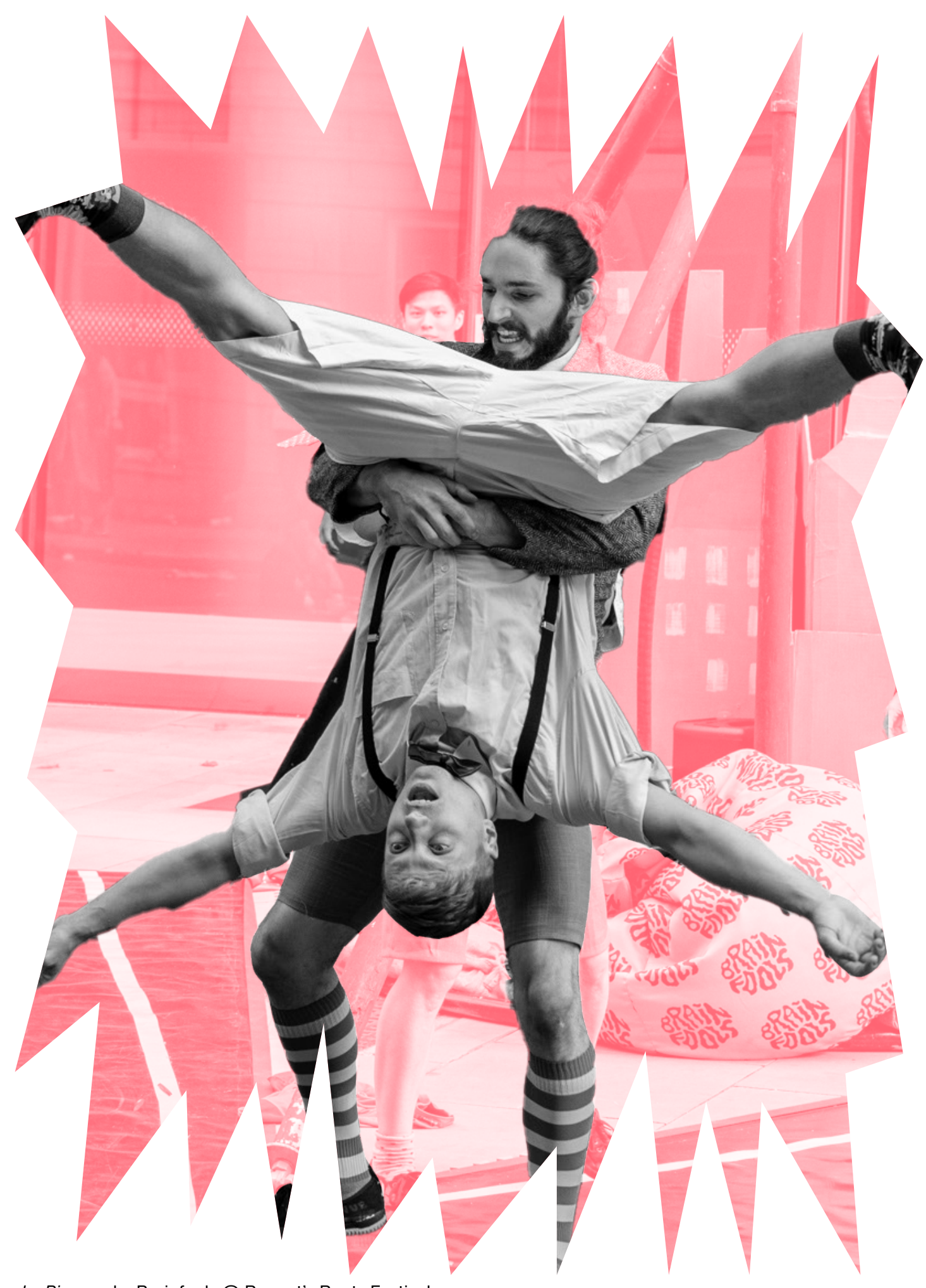
Lucky Pigeons by Brainfools @ Regent's Roots Festival