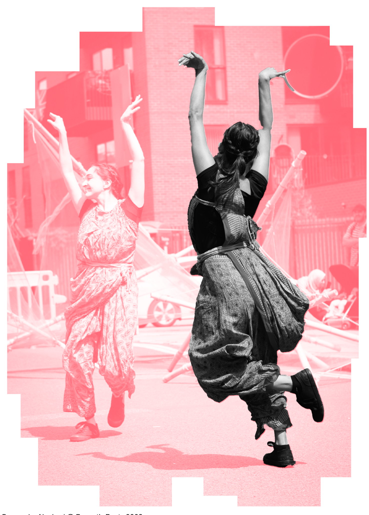
Pravaas by Akademi @ Regent's Roots 2023